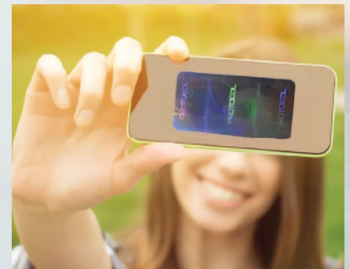
Place Shield on Back of Your Cellphone